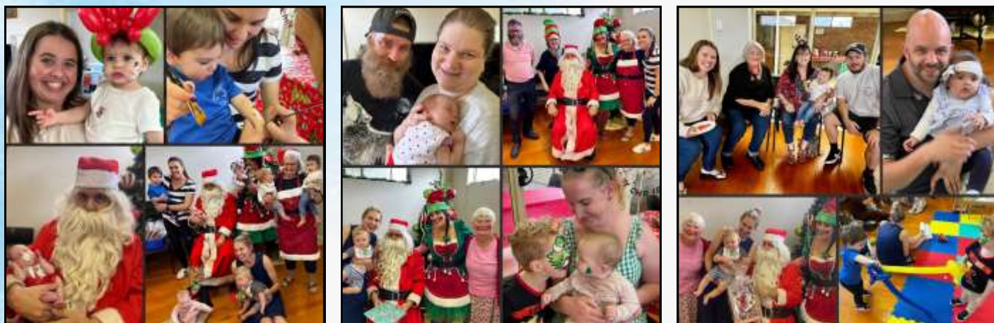
Our APG Christmas Party in December 2022 - a wonderful day!

Want more information? Please contact Chrisso at Ephpheta on 0405 749 488 (SMS)