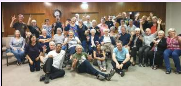
Ephpheta Community Retreat - March 2019

Ephpheta is supporting the costs of the retreat.